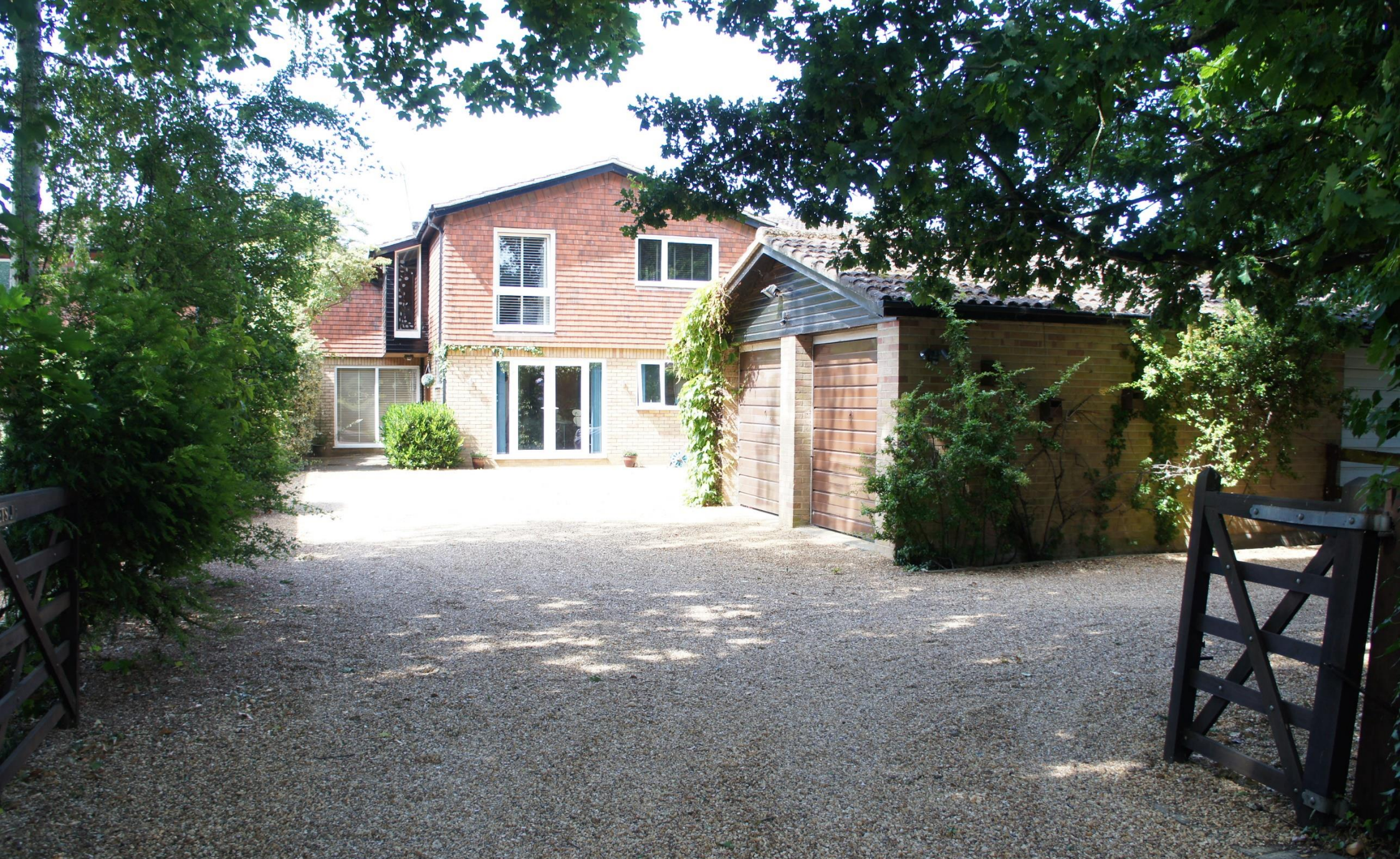
‘The Wickets’, Church Lane, Oakley, Bedfordshire MK43 7RJ