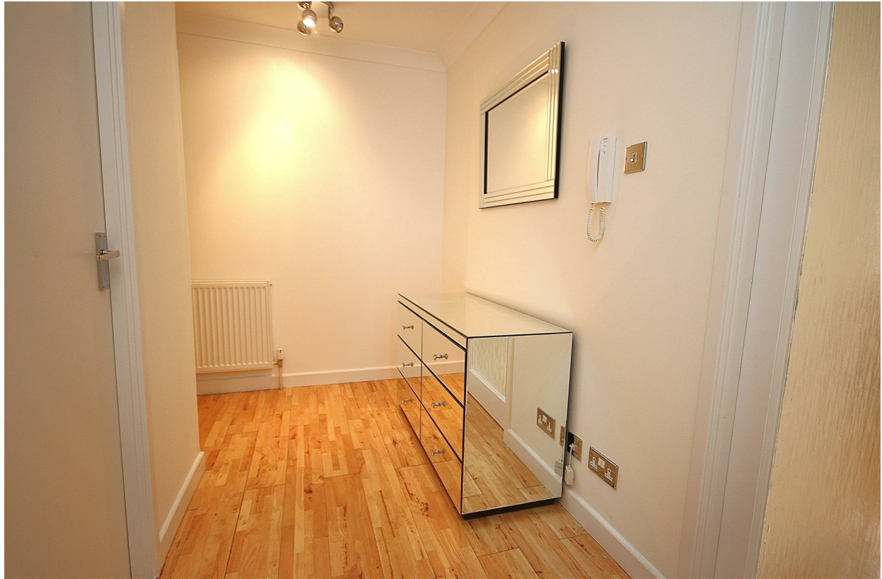
DOUBLE BEDROOM: 14'01" x 9'10" (4.29m' x 3.00m' ) Double Glazed Window to Front, Carpeted, Radiator, Wardrobe