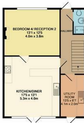
GROUND FLOOR APPROX. FLOOR AREA 609 SQ. FT. (56.6 SQ. M.)

DIRECTIONS: JT MAP 5, 8BB No 2 is two doors to the left of Trinity village shop.