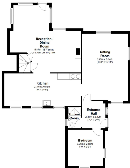
Ground Floor Approx. 908 sq ft (84 sq m)