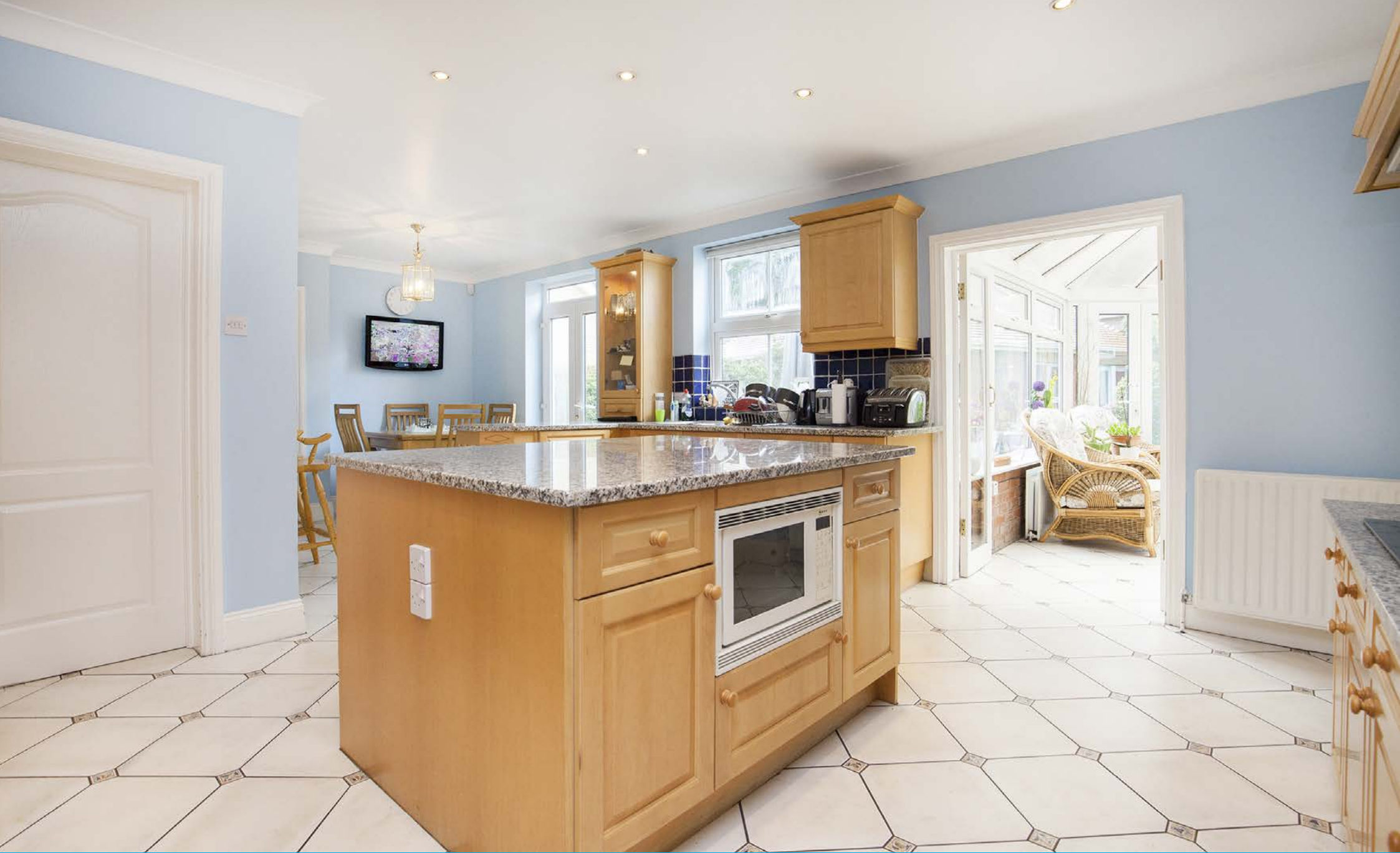
Kitchen / Breakfast Room