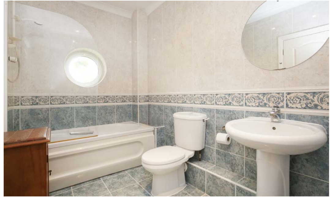
Bedrooms & En Suites