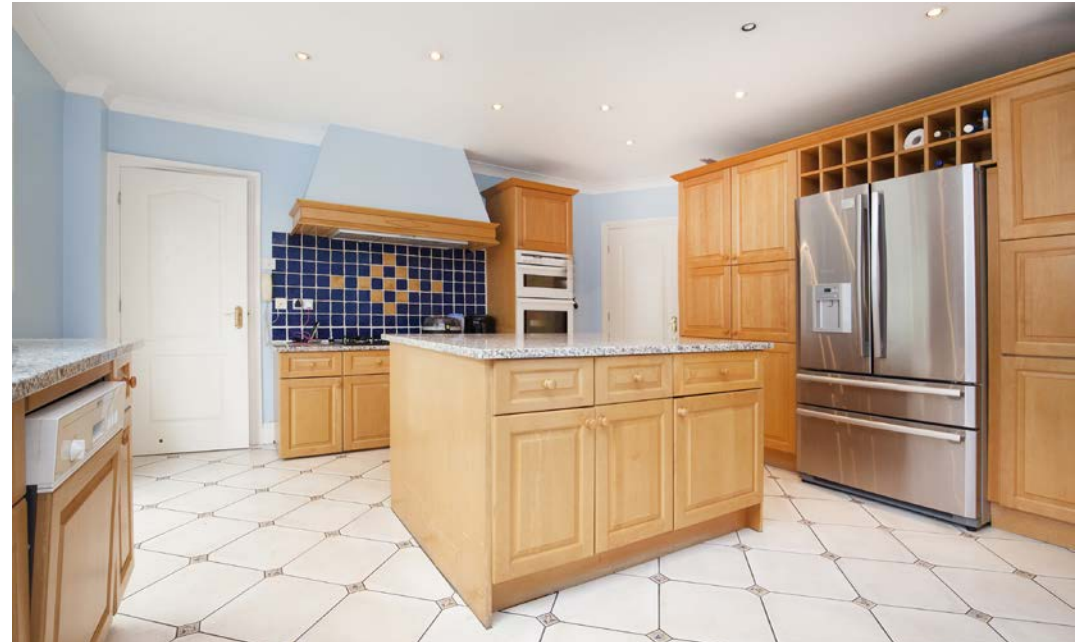
Other Ground Floor Images