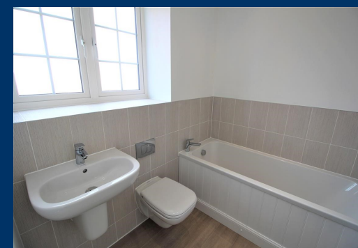
Plot 41 Castle Fields Dunster, Minehead, Somerset, TA24 6PH