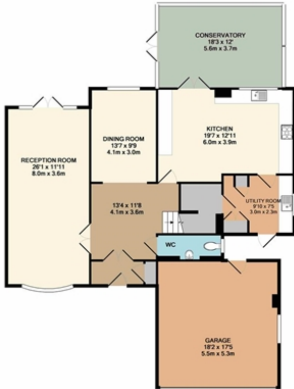
GROUND FLOOR APPROX. FLOOR AREA 1542 SQ.FT. (143.3 SQ.M.)