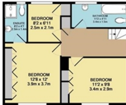
1ST FLOOR APPROX. FLOOR AREA 530 SQ. FT. (49.2 SQ. M.)

TOTAL APPROX. FLOOR AREA 1280 SQ. FT. (118.9 SQ. M.) Whilst every attempt has been made to ensure the accuracy of the floor plan contained here, measurements of doors, windows, rooms and any other items are approximate and no responsibility is taken for any error, omission, or mis-statement. This plan is for illustrative purposes only and should be used as such by any prospective purchaser. The services, systems and appliances shown have not been tested and no guarantee as to their operability or efficiency can be given. Made with Metropix Q2018