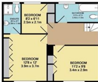
1ST FLOOR APPROX. FLOOR AREA 530 SQ. FT. (49.2 SQ. M.)

TOTAL APPROX. FLOOR AREA 1280 SQ. FT. (118.9 SQ. M.)