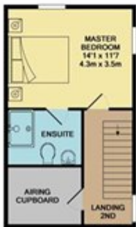
2ND FLOOR APPROX. FLOOR AREA 360 SQ.FT. (33.4 SQ.M.)

TOTAL APPROX. FLOOR AREA 1130 SQ.FT. (104.9 SQ.M.)