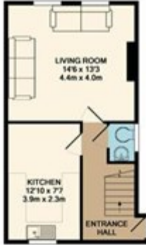
GROUND FLOOR APPROX. FLOOR AREA 383 SQ.FT. (35.5 SQ.M.)