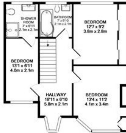
1ST FLOOR APPROX. FLOOR AREA 580 SQ.FT. (53.9 SQ.M.)

TOTAL APPROX. FLOOR AREA 1432 SQ.FT. (133.0 SQ.M.)