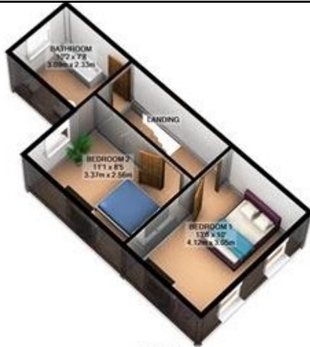
1ST FLOOR APPROX. FLOOR AREA 413 SQ.FT. (38.4 SQ.M.)