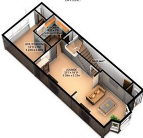
GROUND FLOOR APPROX. FLOOR AREA 553 SQ.FT. (51.3 SQ.M.)

TOTAL APPROX. FLOOR AREA 966 SQ.FT. (89.7 SQ.M.)