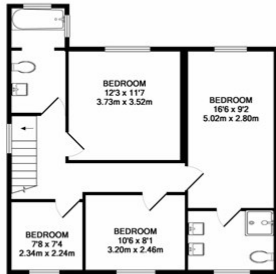
1ST FLOOR APPROX. FLOOR AREA 645 SQ.FT. (59.9 SQ.M.)

TOTAL APPROX. FLOOR AREA 1453 SQ.FT. (135.0 SQ.M.)