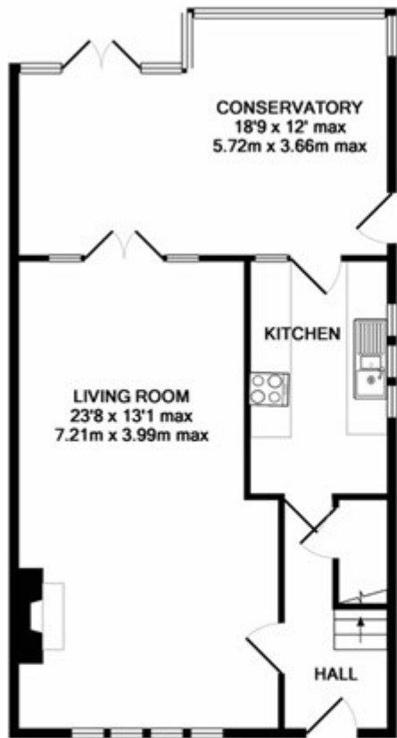
GROUND FLOOR APPROX. FLOOR AREA 629 SQ.FT. (58.4 SQ.M.)